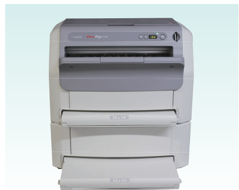
DRYPIX Lite shown optional sheet feeder unit and 2magazines

Specifications are subject to change without notice. All brand names or trademarks are the property of their respective owners. In some countries, regulatory approval may be required to import medical devices. For the availability of these products, please contact your local sales representatives.