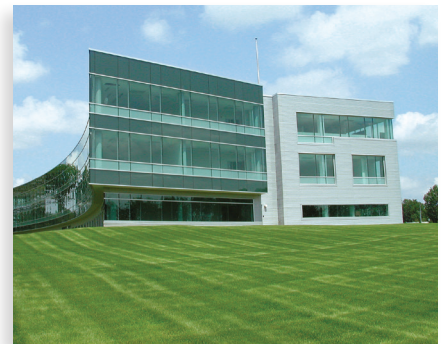
Mindray North America Headquarters Mahwah, New Jersey

For more information about Mindray products for veterinary practice and animal research, visit www.mindray.com .